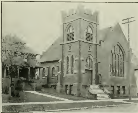
HOUGHTON, MICH. (Church)